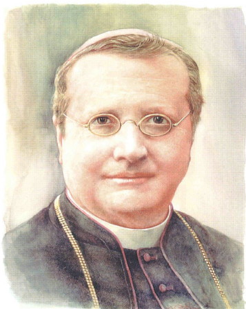
Saint Guido Maria Conforti

Throughout the pandemic, as we have become aware, we need more and more of that oil called ‘patience, understanding, thinking of others, and compassion,’ especially with those we rub elbows with, that is, we spend more time with than before.