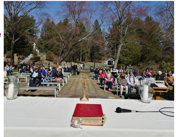
Outdoor Easter morning Mass at Fatima Shrine