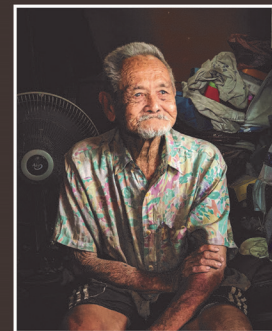
2021 Pro-Mission Raffle

"In the evening of life, we will be judged on love alone."