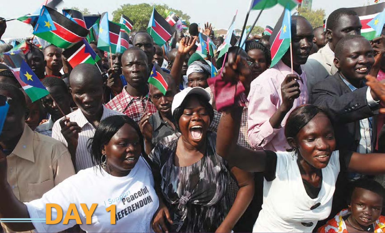
A joyful crowd celebrates South Sudan's independence in 2011.