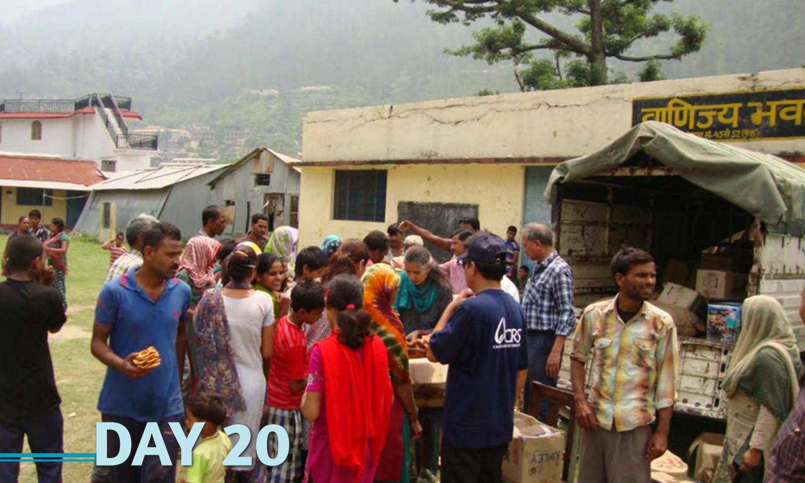
CRS staff distribute food to flood victims in northern India.