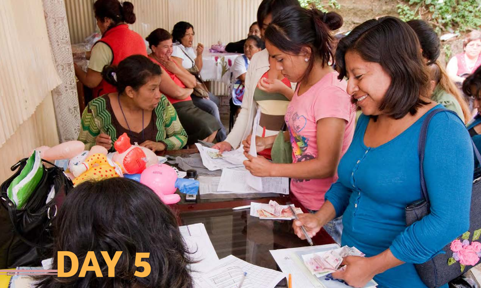
CRS microfinance programs help women in Oaxaca, Mexico, start their own businesses so they can provide for their families.