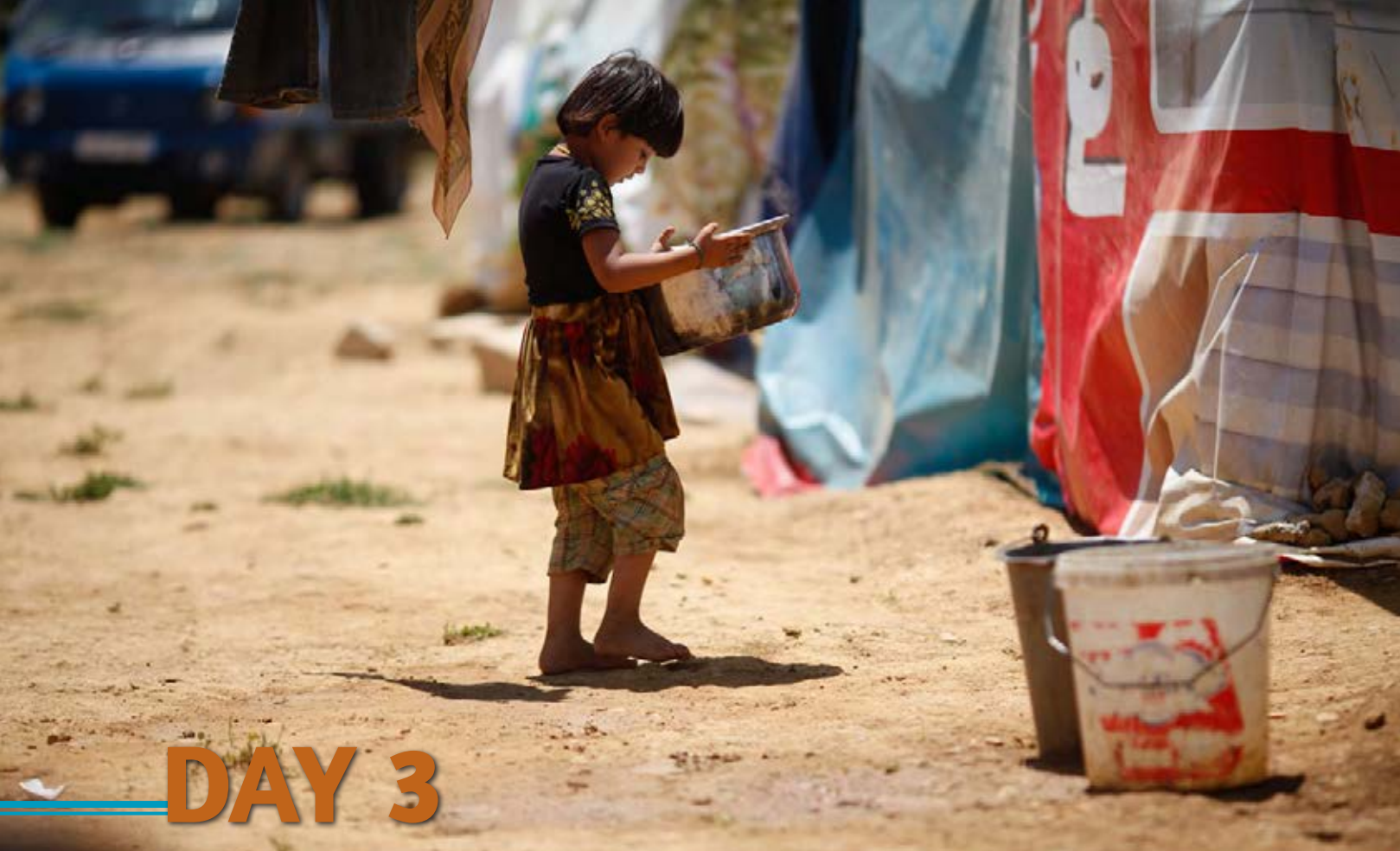
A young Syrian girl carries water to her family's makeshift tent at an informal refugee settlement in Lebanon's Bekaa Valley.