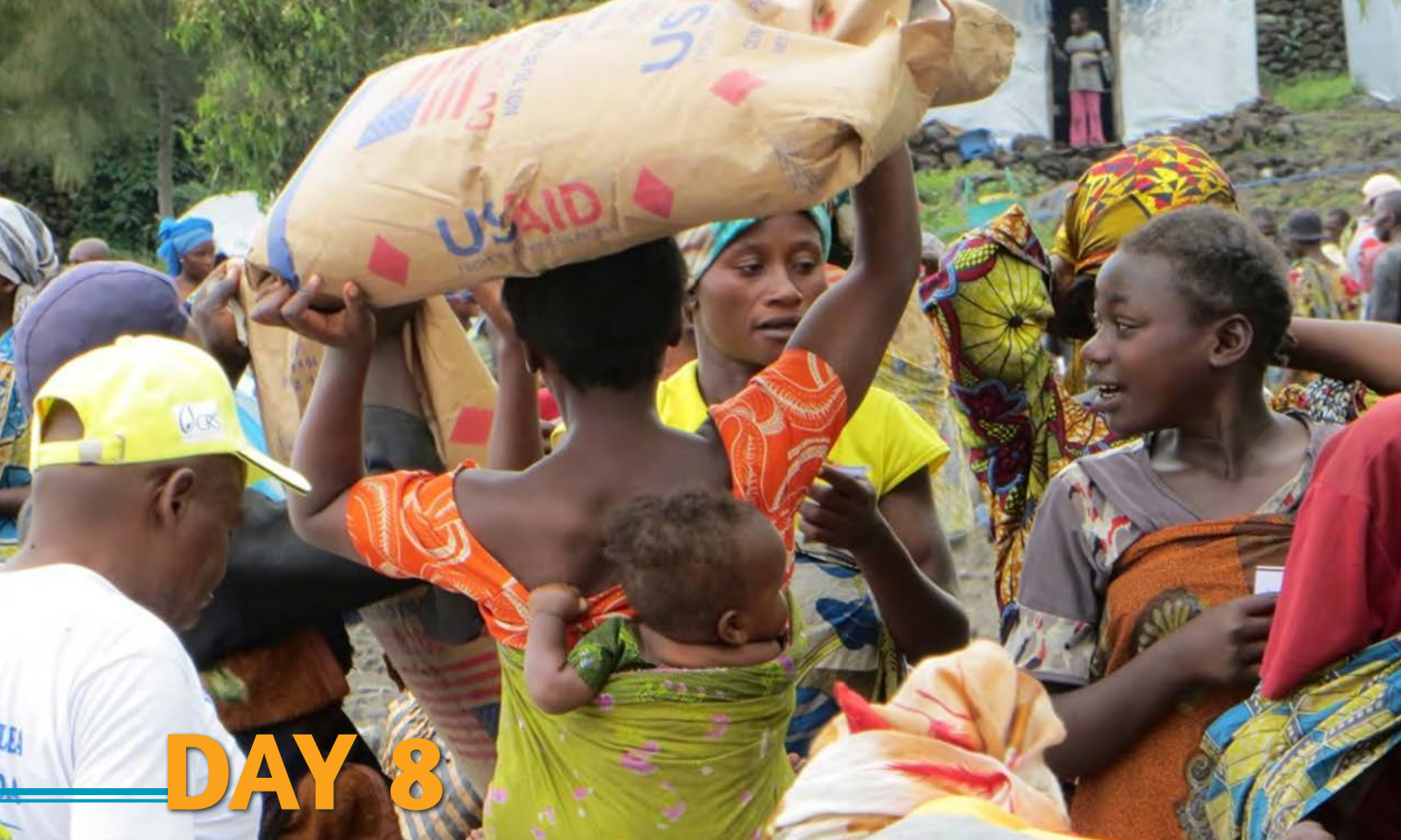
Congolese refugees line up for supplies at a CRS food distribution site.