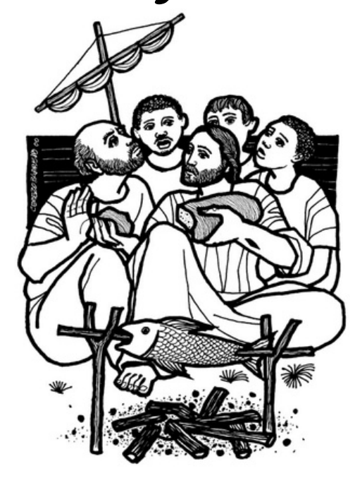
Feed My Lambs

You may have noticed the title of Fatima Shrine on the sign next to the road or in publications. It reads: "The Missionary Shrine of Our Lady of Fatima."